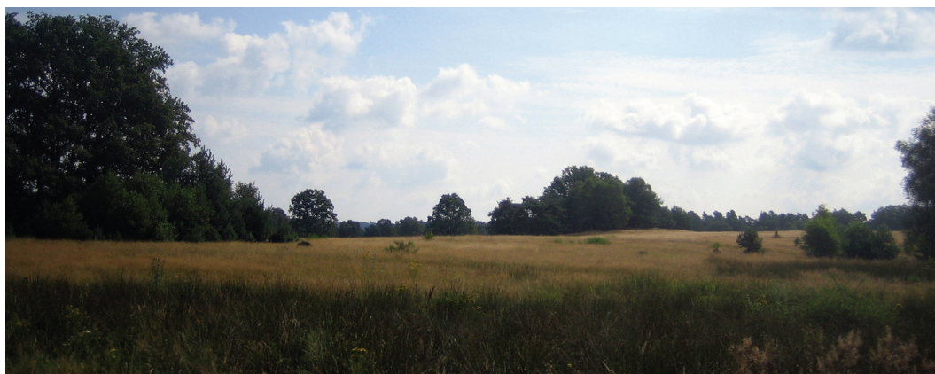
FIGURE 1 Extensive grasslands of the still active military training grounds in Bergen, Lower Saxony.

The majority of them is characterised by two specific aspects. First, most of them are extremely rich in terms of biodiversity. The lack of major traffic infrastructure, the exclusion of intensive agriculture and the military practice itself, which includes destructive activities such as tank driving and deliberate vegetation management, has led to the creation and preservation of habitats for rare species. Thanks to this and the sometimes even idyllic appearance, especially of training areas (Fig. 1), a perception is widespread nowadays of the military being perfect environmentalists. Such outstanding ecological qualities are also the focus of current political programmes. Many areas are central elements of the federal initiative "National Nature Heritage", which hands over these sites for nature preservation. Former and even partially active, large-scale military landscapes are now preserved as nature reserves and biosphere reserves, Natura 2000 areas or, since the withdrawal, even form National Parks.