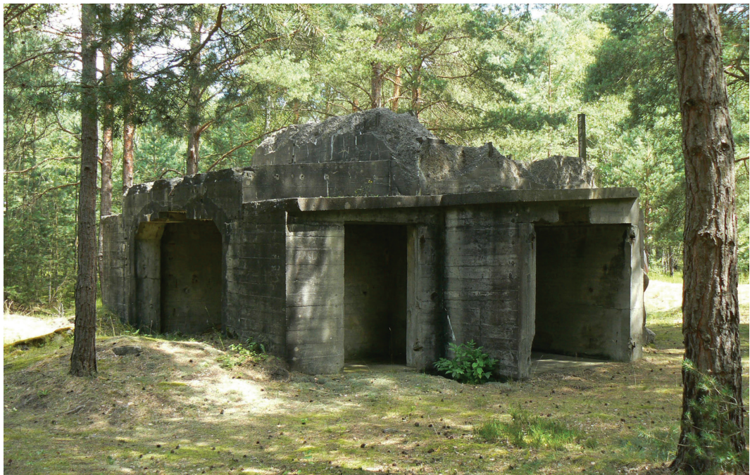
FIGURE 4 Ruins of a test facility in Kummersdorf. (Photograph © Denkmalamt Teltow-Fläming).

The importance of preventing, in the words of Assmann, "ghostly places" (1999, p. 21) from emerging becomes evident at the former army research centre south of Berlin: the "Heeresversuchsstelle Kummersdorf-Gut/ Sperenberg airfield". After land had been bought and partially expropriated, from 1874–1877 a shooting ground and later test facilities for railways were installed in the forests of Kummersdorf (Pöhlmann, Bauermeister, Sommerer, 2014, pp. 12–17). Remnants of these are still visible today. The site's military history continued during WWII, when research and tests, for example on guns, battle tanks, intermediate-range missiles and nuclear bombs, were carried out (Pöhlmann, et al., 2014, pp. 24–31). These technological findings were closely related to atrocities committed on forced workers in the arms production and had a devastating impact, as the weapons were used for bombarding European capitals in World War II (Pöhlmann et al., pp. 27–28). The barracks and the military airport that were later built on the same site by the Soviet Army have been abandoned since 1994.