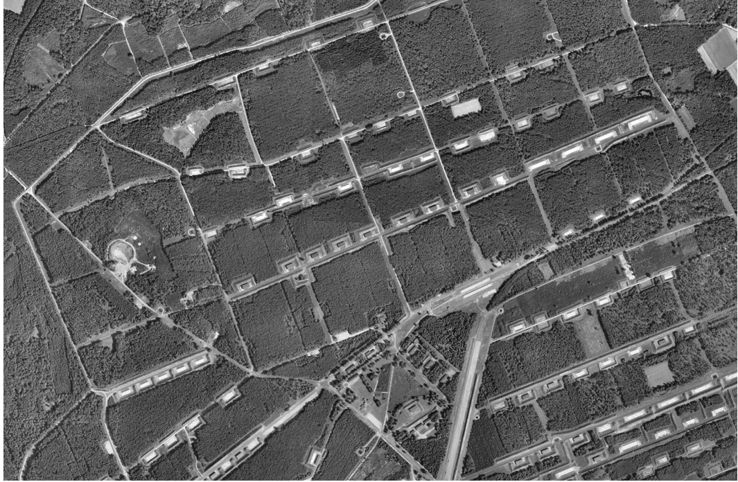
FIGURE 7 Aerial view of the former ammunition depot in Brüggem-Bracht, 1997: A rectangular pattern of embankments surrounds open and indoor stores. (Aerial photograph © LAND NRW (2018) – Licence: dl-de/by-2-0 ( www.govdata.de/dl-de/by-2-0 )).

During its military use, the site was maintained intensively. To prevent fires, the army kept the vegetation short on the embankments, around the buildings and paths (NRW-Stiftung, n.d., (a)). This management and the poor, sandy soils created habitats similar to the former sheep pastures. While still being used militarily, the ecological value of this site was recognised and researched (P. Kolshorn, interview, September 19, 2018). This was the motivation to transform more than two-thirds of the site into a nature reserve, now owned by a foundation and managed by professional ecologists. The local population welcomed this decision and can now find recreation in the region's largest nature reserve (P. Kolshorn, interview, September 19, 2018). The landscape maintenance is carried out with the help of Konik ponies, Galloway cattle, fallow deer and approximately 600 sheep and goats (P. Kolshorn, interview, September 19, 2018; NRW-Stiftung, n.d., (a)).