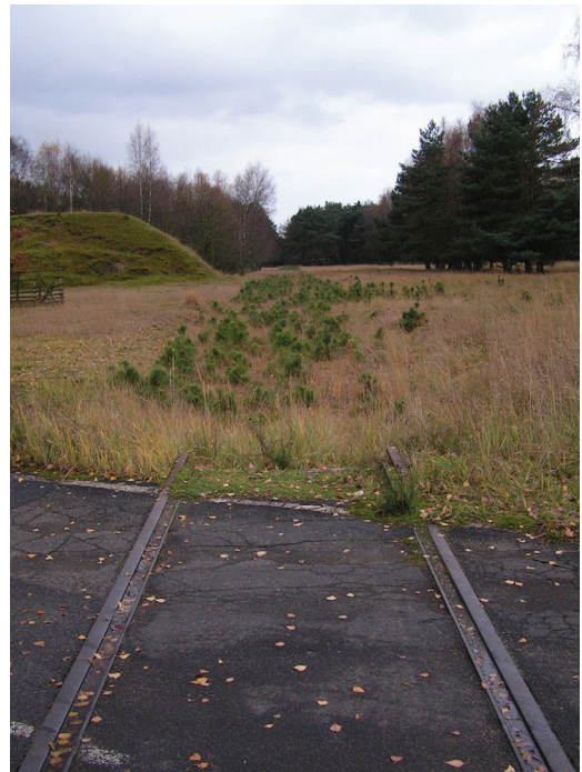
FIGURE 10 Rail tracks disappear into the grassland. Such fragments arouse the visitors' curiosity.