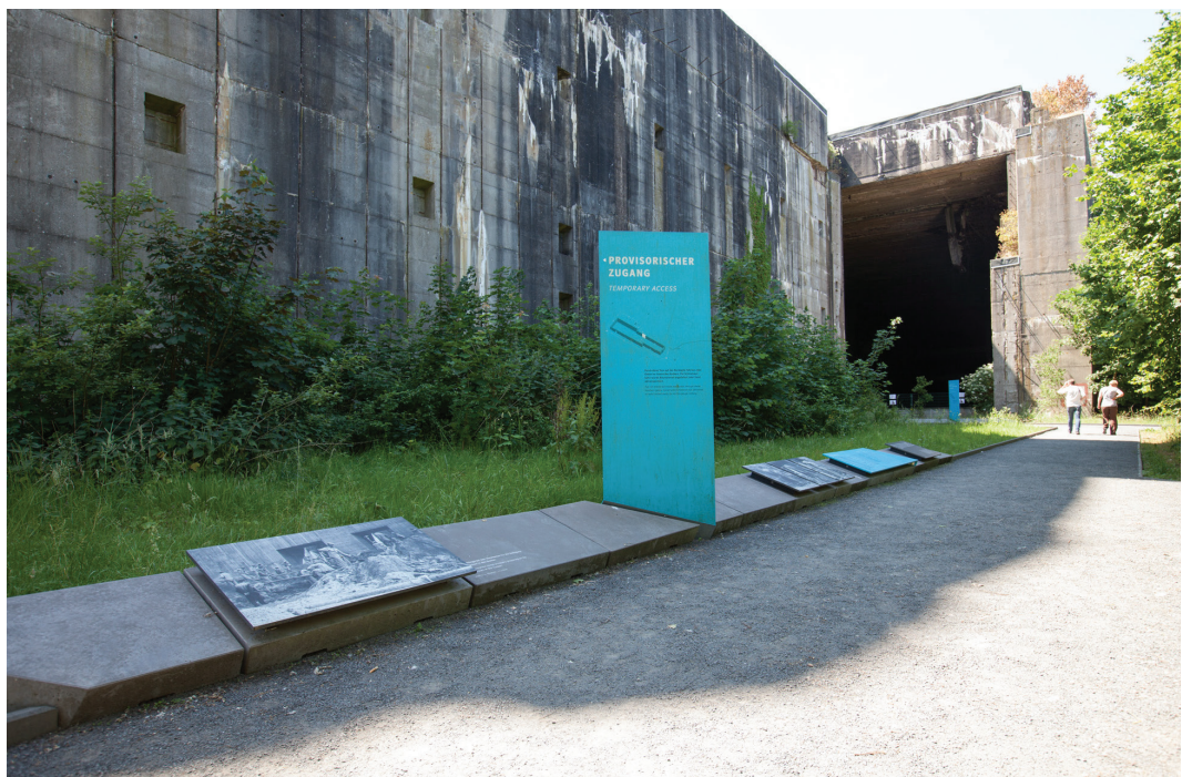
FIGURE 3 Many military sites are related to atrocities. Today, a visitor centre and outdoor exhibition seeks to explain the relics of the U-Boot Bunker Valentin in Bremen-Farge and the suffering experienced here. (Image by Landeszentrale für politische Bildung Bremen / Photograph by Henry Fried).

The landscape's militarisation required not only space, but also a large workforce, which, owing to the circumstances under which the work was carried out during a certain period of history, is a crucial aspect of this landscape. A peak of militarisation happened during preparations for the Second World War, when forced workers, concentration camp inmates and prisoners of war were forced by the NS regime to construct military infrastructure. One example is the U-Boot Bunker Valentin in Bremen-Farge in northern Germany, where more than 1100 prisoners died of malnutrition, disease, and arbitrary executions (Landeszentrale für politische Bildung Bremen, 2015). An extraordinary number of victims is reported in the case of the labour camp Lieberose, where between 6,000 and 10,000 people were imprisoned to construct the Kurmark training area (Evangelische Kirchengemeinde Lieberose und Land, n.d.). In the years 1943–1945, more than half of the prisoners died subjected to the motto "Extermination through labour" (Evangelische Kirchengemeinde Lieberose und Land, n.d; Angolini, 2004, p. 2). The prisoners constructed the labour camps, barracks, military installations of the training area, and roads that are still partially in use today (Evangelische Kirchengemeinde Lieberose und Land, n.d.; Angolini, 2004, pp. 14–15).