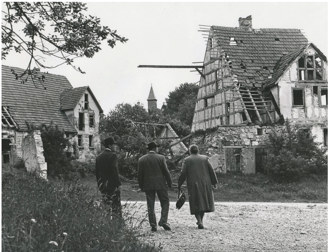
FIGURE 2 Former inhabitants visit the partially destroyed village of Gruorn, located in the Schwäbische Alb in southwest Germany. Today, only the foundations of the houses are left, while the church and schoolhouse have been reconstructed.

To achieve this, former civilian areas had to be depopulated. For example, for the construction of the Kurmark training area, about 80km southeast of Berlin, 17 villages with almost 4400 inhabitants were required to leave the area of the planned military grounds from 1943 onwards (Angolini, 2004, p. 12). Many witnesses and documents of that time report that if inhabitants did not leave their homes voluntarily, they were forcibly resettled and expropriated. This procedure did not end after the Second World War. The occupying troops also requisitioned civilian land, both in the East and the West. After the depopulation, the former civilian settlements became backdrops and settings for urban warfare or were purposefully destroyed. Apart from rare exceptions, only ruins have remained.