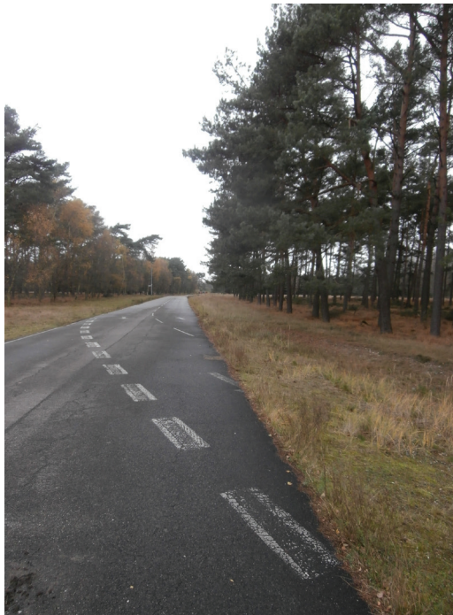
FIGURE 9 Relics of former infrastructural elements at Brüggem-Bracht. Road markings lead into the forest