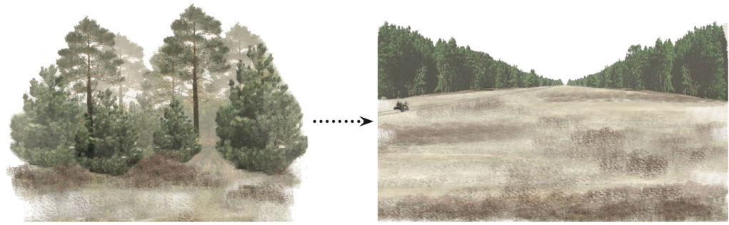
FIGURE 6 One important aim of the concept is to increase the site's legibility. The student proposes to fell trees (left) to reconstruct parts of the 12km-long shooting ranges (right) that were installed to test the flight characteristics and impact of the tested ammunition. (Schüler, 2016).

A wide range of interested volunteers, such as ecologists, preservationists and historians, ensures high diversity among the voluntourists. The proposed activities include measures such as felling trees to reveal the overgrown former shooting ranges (Schüler, 2016). This supports two aims: the regeneration of open heathland structures and the partial reconstruction of a spatially impressive military heritage (Fig. 6). Parallel to this, historians are researching the site's past, and relics are being conserved or reconstructed. Other groups offer or join guided tours and events for tourists, students and pupils. Neighbours are also one of the target groups. With their vivid memories of the more recent history they are encouraged to offer guided tours and share their views (Schüler, 2016).