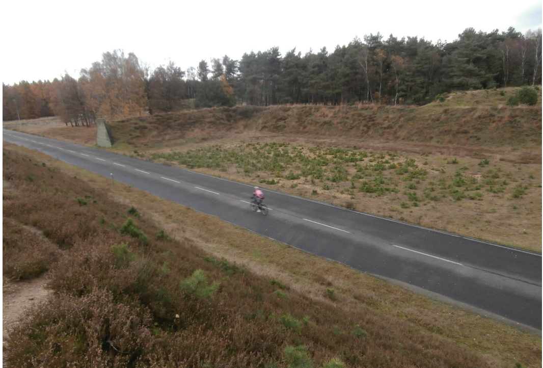
FIGURE 8 Former ammunition storage in Brüggem-Bracht. Almost all buildings were removed, but the protective embankments of Europe's once largest ammunition depot still structure the site. (Photograph by V. Butt).