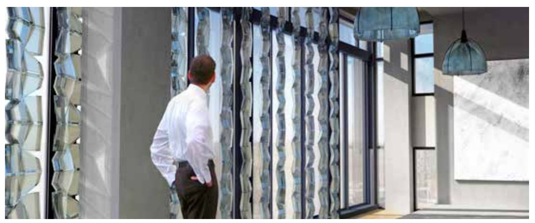
FIGURE 2 Architectural rendering DoubleFace