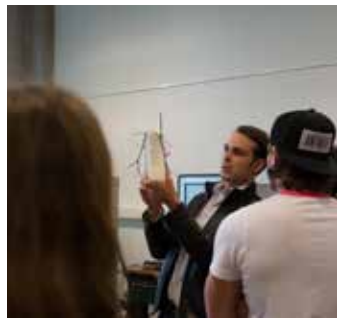
FIGURE 5 Demonstration