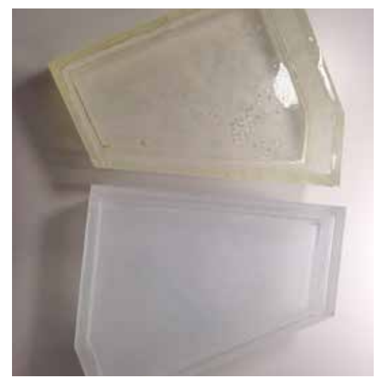
FIGURE 4 Prototype container resin-perspex