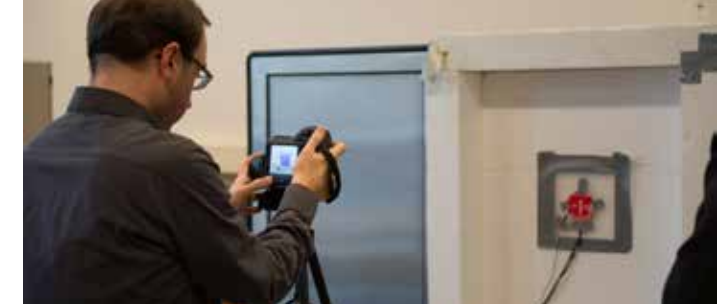
FIGURE 6 Testing