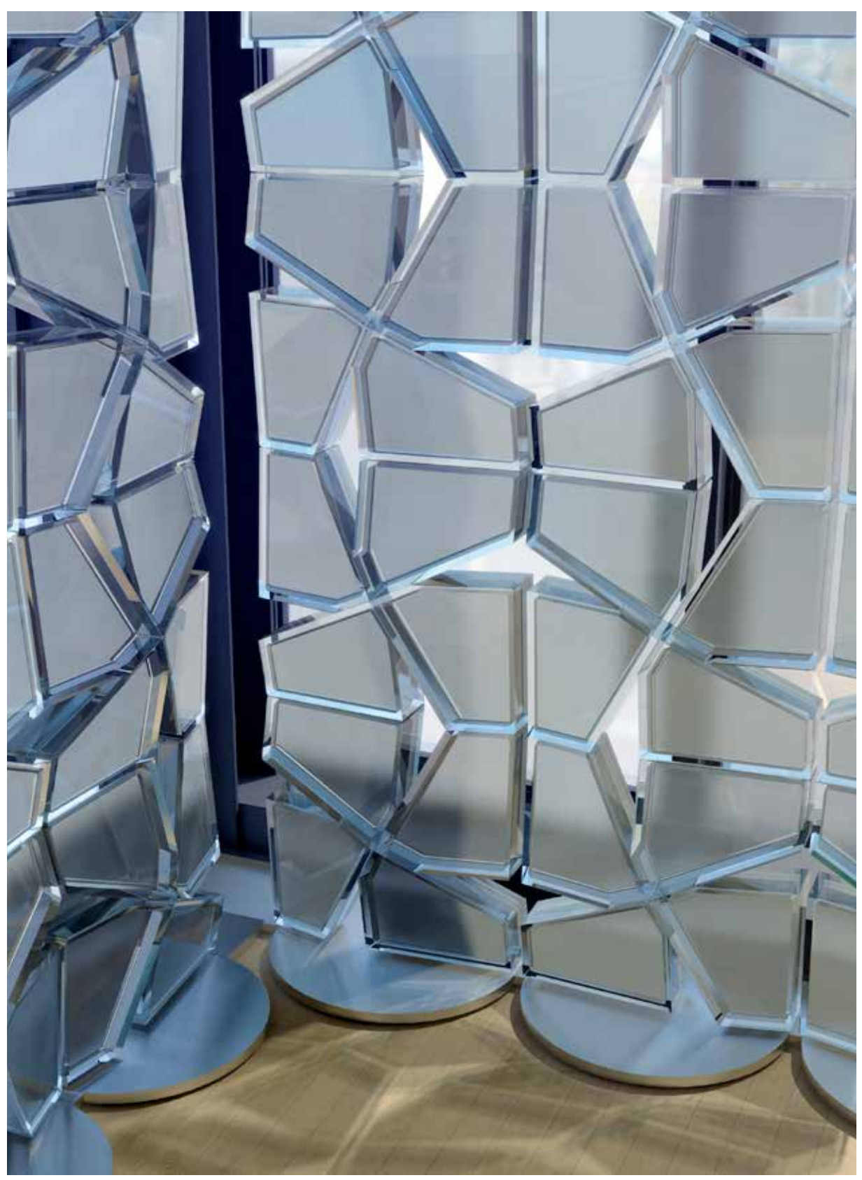
FIGURE 1 DoubleFace: adjustable Trombe wall system leads to an energy reduction of roughly 40%

7 Turrin, M., Tenpierik, M., de Ruiter, P., van der Spoel, W., Chang Lara, C., Heinzelmann, F., Teuffel, P., & van Bommel, W. (2014). DoubleFace: Adjustable translucent system to improve thermal comfort. SPOOL, 1(2), 5-9. doi:10.7480/spool.2014.2.929