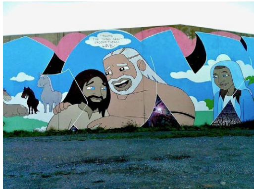
FIGURE 8 Artwork by Richard ‘Popx Art’ Baker (2011)

The aesthetic and style that may be experienced in the drawings, colouring and wording of Ōtautahi: An Origin Story are remarkably different from the design and language in the overall convention centre design presentations (Fig. 5 i-j). The colourful comic-inspired aesthetic, as well as the fact that the physical part of the project is mounted on the hoardings, instead creates a direct line of reference to the large quantity of graffiti, murals and street art that has emerged in Christchurch.