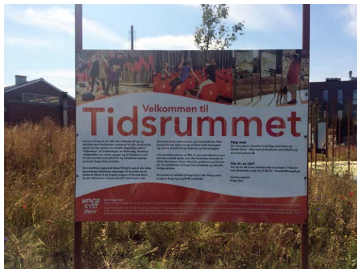
FIGURE 13 a-b. The information poles. Panels mounted along the map-square feature a variety of information, from real estate promotion to archaeology. (2015)