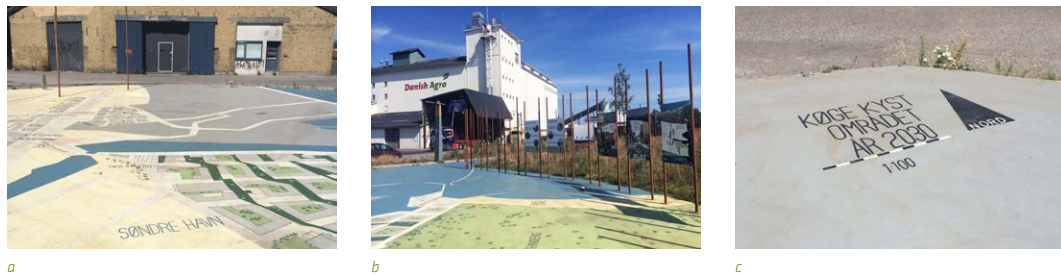
FIGURE 2 The 2030 project plan. The large painted graphic creates an entrance point to The Space of Time and the harbour development. (2015)

mediatization (Christmann et al., 2020) and how narratives concerning sites are selected, cultivated and distilled (Beauregard, 2020).