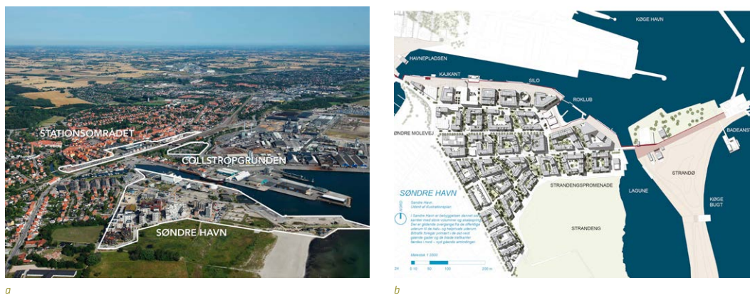
FIGURE 4 a. Søndre Havn in Køge. Aerial view of the harbour development area. b. Søndre Havn masterplan. The illustration shows the masterplan as published in 2011. (Illustrations: Køge Kyst and Vandkunsten, 2011)