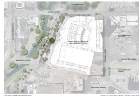
FIGURE 7 Proposed landscape concept plan from Christchurch Convention and Exhibition Centre Outline Plan Submission: Urban Design and Landscape Statement March 2017