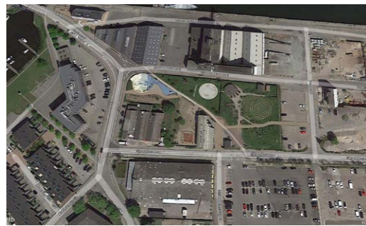
FIGURE 11 Aerial view of The Time of Space and its surroundings. The Time of Space and its large map are situated in the middle. (Illustration: Google Earth, 2021)

The temporary 'Phase Zero' spaces are located along 'The Thread' (Tråden) through the harbour area. This consists of a narrow pathway meandering through a mix of empty lots and still active businesses. Information signposts and panels about the transformation are distributed throughout the harbour. Five temporary urban spaces have been under development since 2011. These are, for the most part, located on sites which are intended for development in the later phase of the development, thereby reflecting more of a semi-temporary approach and character.