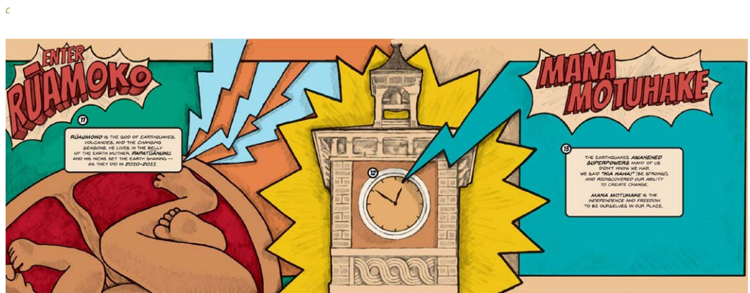
FIGURE 5 Ōtautahi: An Origin Story