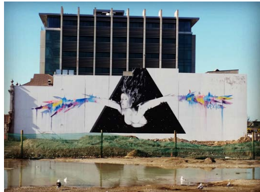
FIGURE 9 Artwork by Vexta (2015)

Street artworks have become prominent urban statements in Christchurch in the aftermath of the earthquake.