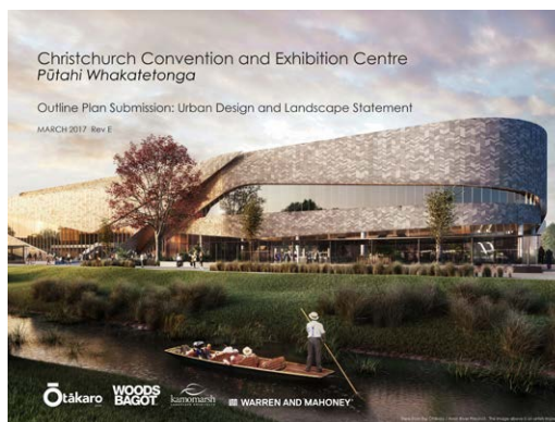
FIGURE 6 Te Pae Convention Centre: View from the Ōtakaro/Avon River Precinc. (Illustrations: Ōtakaro Ltd. | Woods Bagot | Warren & Mahoney | Kamo Marsh, 2017)

In his seminal book What Time Is this Place (1972), urban planner Kevin Lynch depicted how time and change manifest in our spaces and practices. He sketched two ways of considering the passage of time: as cycles and rhythms, and as alterations, ruptures and changes (Lynch, 1972, p. 65). Both types are inherent in both the controllable and the uncontrollable elements of our lives and environments. These diverging time conceptions, some belonging more to perspectives of the longue durée , others to perspectives of absolute eventual character, are linked and combined in Ōtautahi: An Origin Story . From the legend of land, the history of the city, its damage and reconstruction, to the specific building project and personal stories, different temporal narratives are nested and incorporated into one storyline. As a time drawing, the comic strip reflects an 'urban assemblage' of narratives and memories (Dittmer, 2014b, p. 499) or even a type of archival collage (Venezia, 2010, p. 190) with its arranged fragments of stories, figures and artefacts.