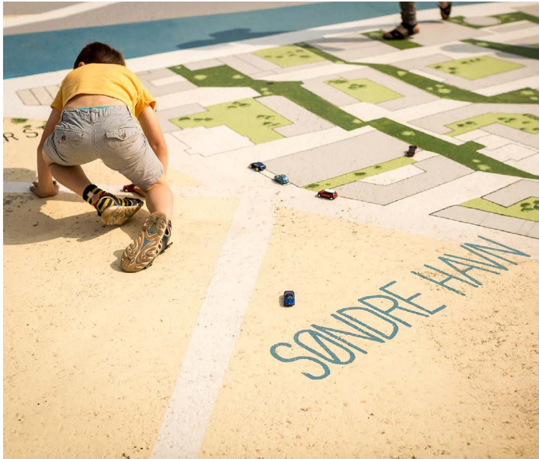
FIGURE 16 Playing the future. Children playing with miniature cars on the painted masterplan-square

In one way, the 2030 map is just a simple display of a future masterplan. But since it is located on site it also becomes a floor pattern, a scenography for the present – an intentional part of the urban design accommodating specific practices. Furthermore, additional stories and time perspectives are gathered around the square on the panels. These are multiple and exchangeable, featuring stories about archaeological discoveries, event documentation, real estate advertisements, and much more. Just as in the case of Ōtautahi: An Origin Story, the masterplan square exists in multiple forms. It is an on-site supergraphic, enacted through performative use, and it exists in mediated forms online. While not being a design tool that engages in the actual design of the future plan, it is used to shape and enact the space while waiting. While the ground mural will be gone when its promise has been fulfilled, during the transformation process itself it conveys a projected future to those looking at it.