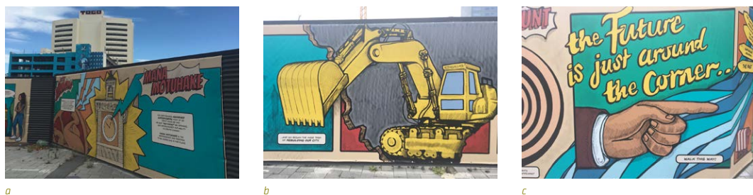
FIGURE 1 Sections of Ōtautahi: An Origin Story. The panels have a particular focus on the post-quake rebuild. (2018)

This paper begins with the analysis of two large-scale visual displays: namely, a long comic strip mounted on a construction site hoarding, and a horizontal ground-level mural covering a public square. Both projects are part of major urban transformation projects. The Ōtautahi: An Origin Story project (2017-2019) was displayed during the construction of the Christchurch Convention Centre (Te Pae), as part of the rebuild of the city of Christchurch (New Zealand) following the devastating 2010-2011 earthquakes.