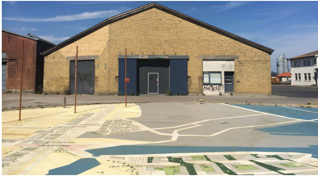
FIGURE 12 The masterplan 2030 at 1:100. The hand-painted plan outlines the square that creates the entrance to the cultural path through the harbour transformation area. (2015)