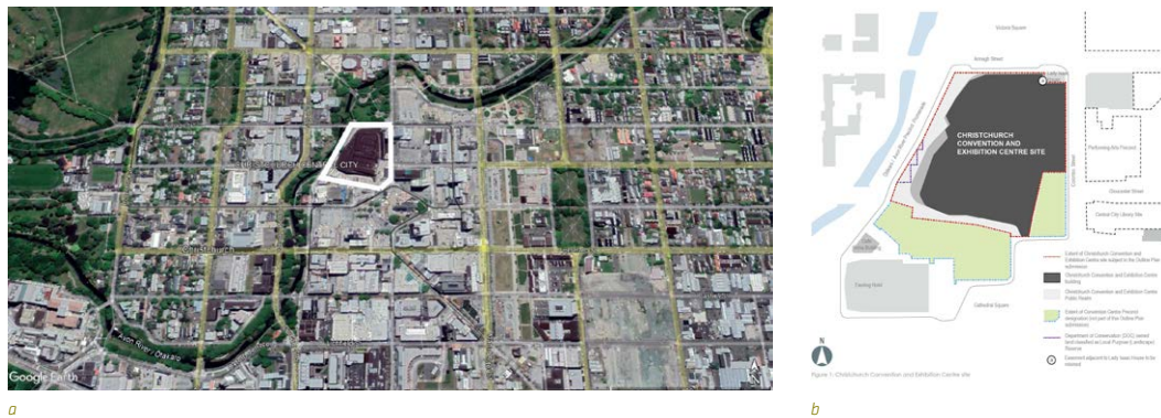
FIGURE 3 a. Aerial view of Christchurch CBD. The outlined area shows the convention centre site and its location in the city centre.. b. Christchurch Convention and Exhibition Centre. The site plan outlines the position of the facility and the adjacent functions and areas, such as the Ōtakaro/Avon River and major cultural facilities. (Illustration: Ōtakaro Ltd. | Woods Bagot | Warren & Mahoney | Kamo Marsh, 2017)