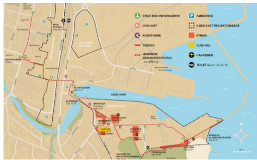
FIGURE 10 The Thread. The cultural pathway through the harbour transformation area in Køge. (Illustration: Køge Kyst, 2015)

The Southern Harbour in the Danish town of Køge is currently undergoing a major transformation from an active industrial harbour into a new, mixed living and working area. The development of the 15.2-hectare area, to be completed by 2030, is led by the consortium group Køge Kyst. The first step in the development plan is 'Phase Zero -The Life Before the City' that includes a cultural 'thread' with temporary urban spaces. It connects the city centre and harbour district. Phase Zero is a strategic testing and activation phase for generating attention and activity in the period before the construction commences. Moreover, the programme contains a set of strategic visions, plus a time schedule for the development and a final masterplan for the year 2030. The blueprint reveals a final status featuring three- to seven-storey building blocks, a clearly defined system of open spaces, and updated recreational facilities in the water and beach areas ((Køge Kyst 2011).