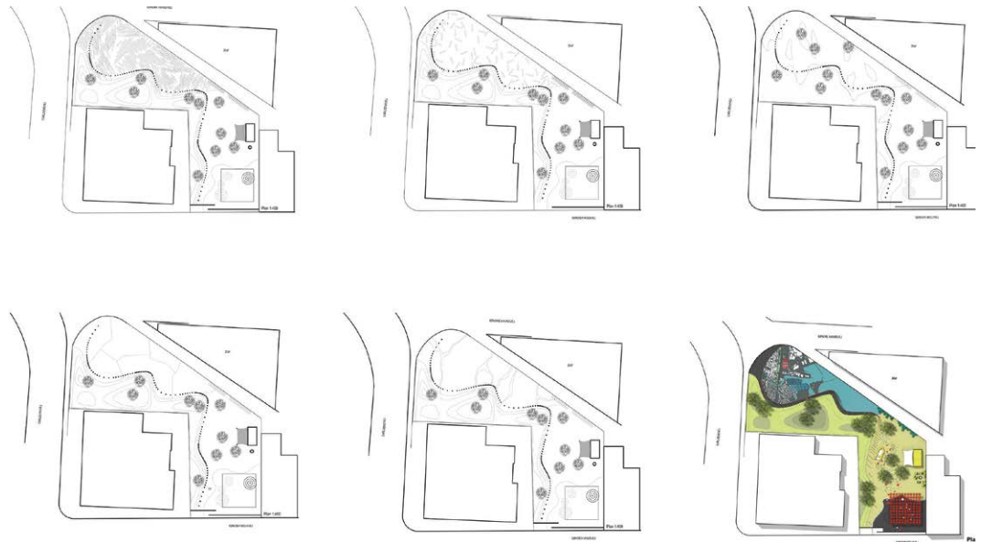
FIGURE 15 Sketches and final The Space of Time plan. The decision on the map concept was taken after a series of sketches had been made testing different decorative patterns. The map-square was then suggested as a good starting point for taking groups on guided tours across the harbour area, and as an important element of Køge Kyst's publicity work. (Illustrations: BOGL + EVM landskab, 2013)

The square with the plan drawing acts as a forecourt and introduction not only to The Space of Time but also to the entire pathway that runs through the harbour. The final details of the painting were partly decided on site, based on sketches, and then hand painted on location. The graphic of the plan resembles a simple baseline plan with layers of streets, building blocks, trees and two types of green areas.