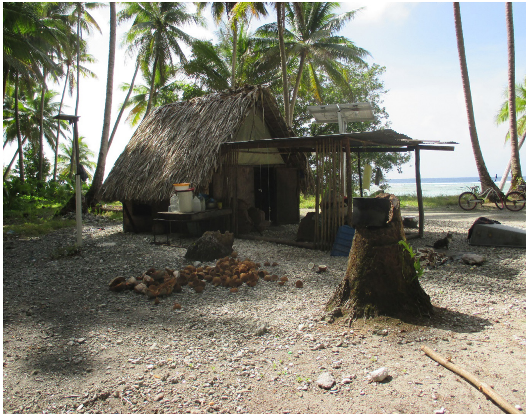
FIGURE 1 Photograph of a modified monkijdrick on Namdrik Atoll. This dwelling demonstrates similar material use and structural design to the monkijdrick, but has closed exterior walls as opposed to four posts.

In Aelon Kein Ad (The Republic of the Marshall Islands), deep time manifests within the everyday production of space. As climate change drastically impacts the shorelines of coastal communities, deep adaptation manifests in two approaches. The first is in-situ adaptation, drawing from Indigenous knowledge systems; the second is migration through expansive kinship-based networks, which also draws on Indigenous knowledge systems. In both responses, the following super-patterns play key roles in the production of supportive environments: land as identity, land as abundance, togetherness, one fire, one family, housing as a model for lineal knowledge, and collective action. Land as identity stems from the traditional land tenure system based on matrilineal inheritance; through migration, the family name always connects kinship groups to the land. Togetherness presents a pattern of social capital that is supported by collective action; families provide resources for each other, looking out for the whole rather than the individual. Living near one another develops a system of wellbeing that promotes individual success. Lastly, multigenerational housing forms a structure that supports knowledge transfer from elders to children. These patterns represent fundamental, broad patterns that support community development through climate change adaptation and migration.