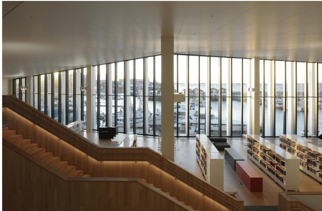
FIGURE 6 The Public Library.

The location of the buildings and well-established links between buildings and their landscape plays a vital role in the project's success. Through the glazed façade, the main spaces of the library create a dialogue between users and the harbour (URL-5). A café is located on the street directly connected to the city. The building, therefore, has become a backdrop to public life, as Rosbottom suggests (D. Rosbottom, personal communication, June 14, 2019). Rosbottom stresses the urban role of two buildings in dialogue with one another as much as they are dialogue with water and city. Stormen Cultural Centre has expedient spaces to build up over time. Rosbottom explains the agency of the building that should be capable of consolidating to bring the coherence to be invisible.