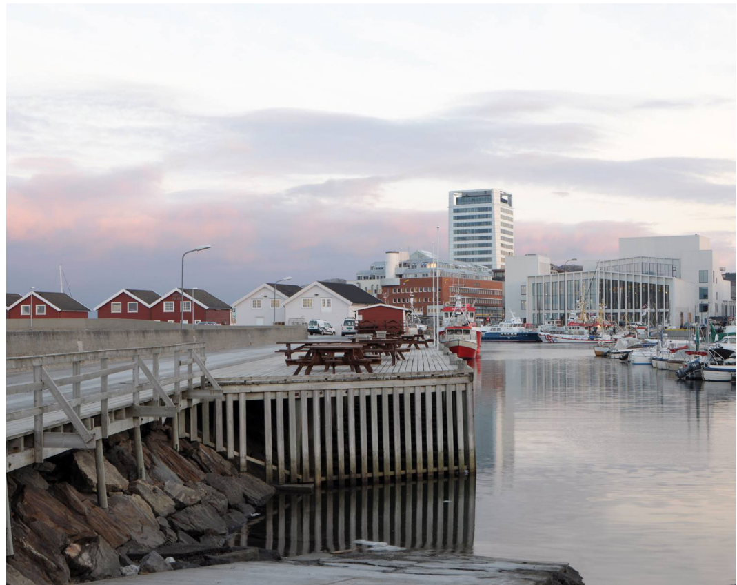
FIGURE 9 Library and Concert Hall Buildings from the harbour.