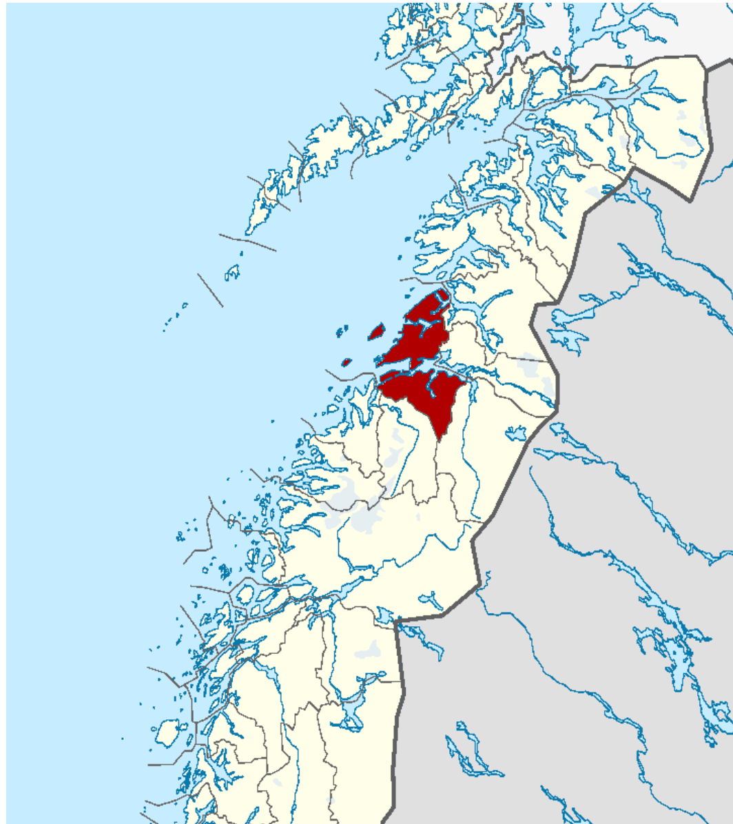
FIGURE 1 Bodø (Wikimedia commons).

groups, had a detailed understanding of building port cities and their representation in promotion for trade. The other group consisted of travellers who depicted port cities and their specific aspects in their works. Port cities and their urban life have attracted the gaze of strangers and were inspirational for travellers, including painters and novelists. They created a large number of artworks. Not only should artworks be understood as a cultural product, but also, they need to be considered as a source of knowledge and insights that could still guide port cities' architectures and urban matters. Therefore, this study introduces consulting to port cities' artworks as a way of thinking in contemporary architectural design towards a unique and site-specific, or, more preferably, situated architecture in those cities 2 . Finding the remedy for the generic architectural results in port cities through artworks is also a tendentious way of explaining port cities' particularity.