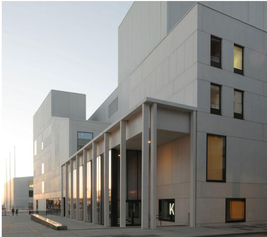
FIGURE 7 A look from the city towards Concert Hall and the library.