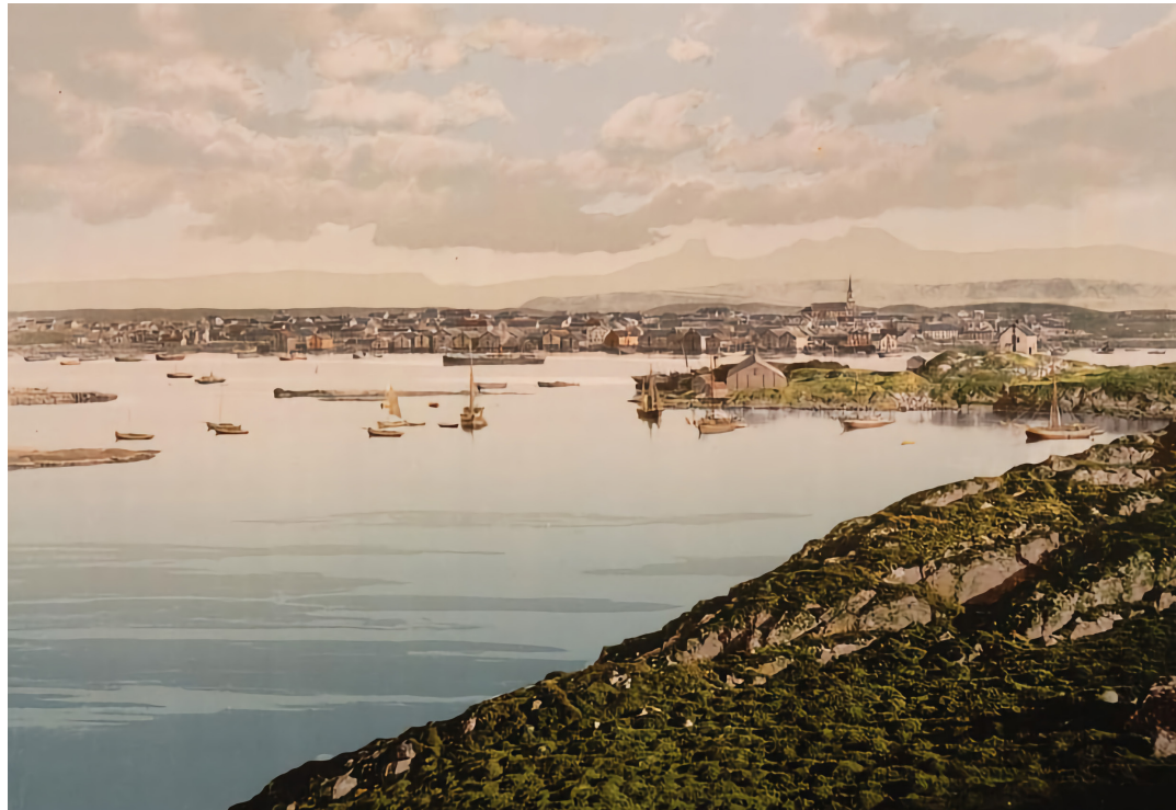
FIGURE 2 Bodø in the late 19 th century (Unknown, ca.1890-ca1900).