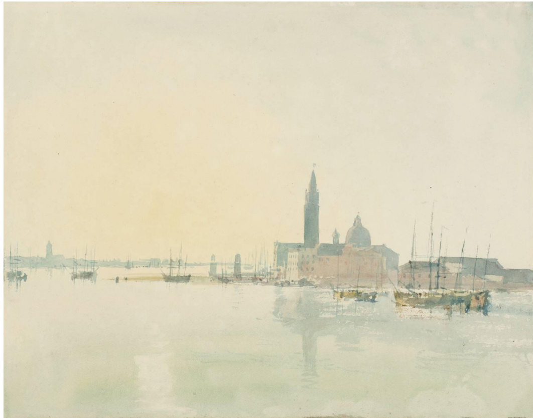
FIGURE 3 San Giorgio Maggiore Early Morning, Joseph Mallord William Turner, 1819.

In this perspective, this article is ordered by following the role of the paintings in architectural design. Throughout the article, the painter and architect are considered similar in the artwork's composition and the architectural design. There is but one difference: the painter captures the knowledge of the existing building with its landscape and embeds it in his frame, whereas the architect unfolds the embedded knowledge in the frame and transmits it into the architectural design process and creation of a new building. The study starts by explaining the roles of both the painter and the architect. First, it touches upon the significance of being a stranger in the context. Then, it zooms into the design process of the project in Bodø by focusing on underlying patterns that led to unique architectural design while aiming to reveal the relationship between the artist and artwork, architect and architecture. It then continues with reflecting on the project with the notion of monumentality, one of the main concerns DRDH carried for the project. In conclusion, the analysis of the design process reveals the paired relations between artworks and architectural design.