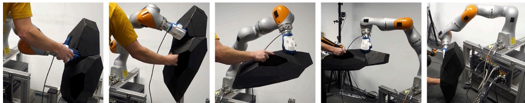
FIGURE 4 HRI-supported pick-and-place study implemented at CoR lab.

HB: I am a strong promoter of collaboration with computer scientists and roboticists. The architect remains the generalist, having an understanding to some degree of all aspects and relying on specialists for the implementation. I presented Design-to-Robotic-Production-Assembly and -Operation (D2RPA&O) methods developed in the Robotic Building (RB) lab at TU Delft. These link efficiently computational design with robotic production, assembly, and operation and employ a customizable multi-robot and multi-effector approach relying on Human-Robot Interaction (HRI) to facilitate effective and safe physical interaction between robots and humans implementing complex tasks.